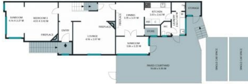
GROUND FLOOR The site plan and floor plan is not to scale. Measurements are indicative and in metres. Bushes and trees are placed for illustration purposes only.