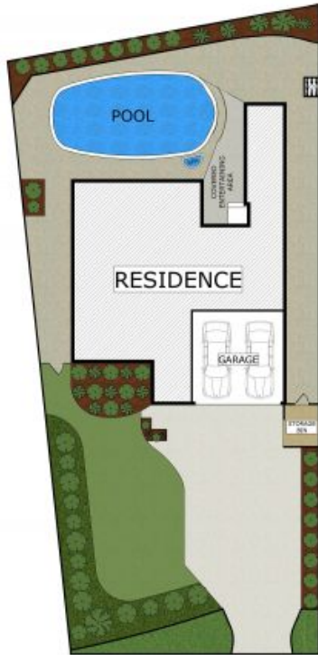
SITE PLAN (NTS)