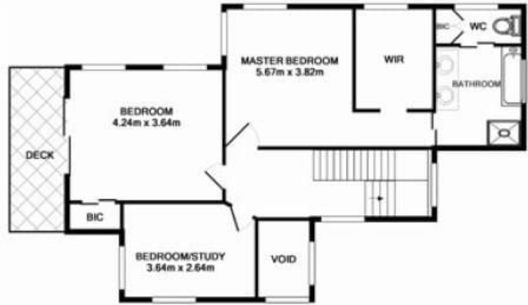
1ST FLOOR APPROX. FLOOR AREA 70.9 SQ. M (783 SQ. FT.)