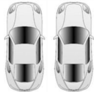
DOUBLE SECURITY CAR SPACES

TOTAL APPROX. FLOOR AREA 132.9 SQ.M. (1431 SQ.FT.) Measurements are approximate. Not to Scale. For illustrative purposes only.