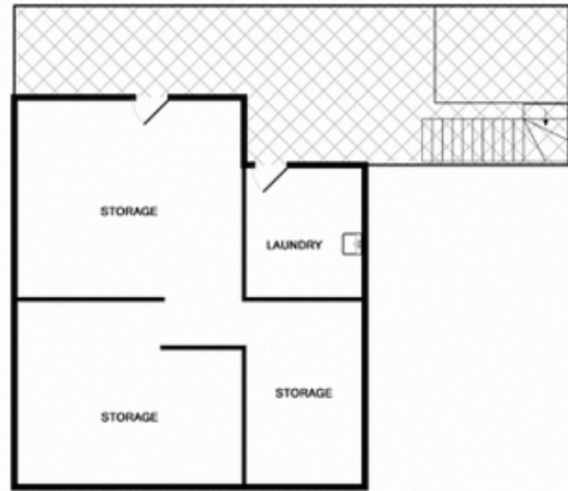
BASEMENT LEVEL APPROX. FLOOR AREA 64.1 SQ.M. (690 SQ.FT.)