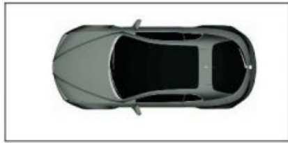
UNDER BUILDING PARKING SPACE