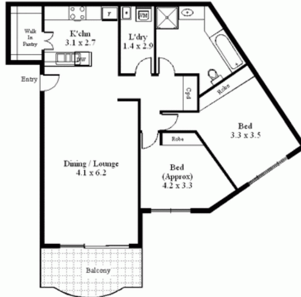
Unit 1 / 316 Pacific Highway, Lane Cove