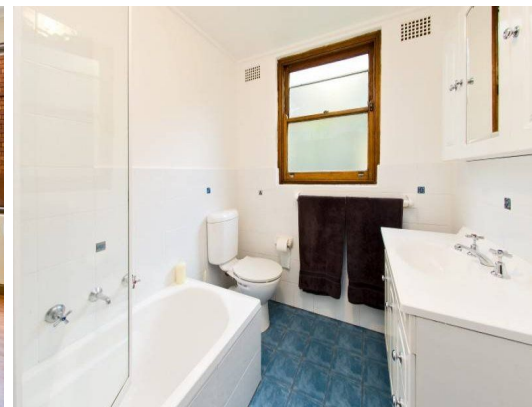
4/88 Burns Bay Road LANE COVE, NSW 2 Beds 1 Bath 1 Car