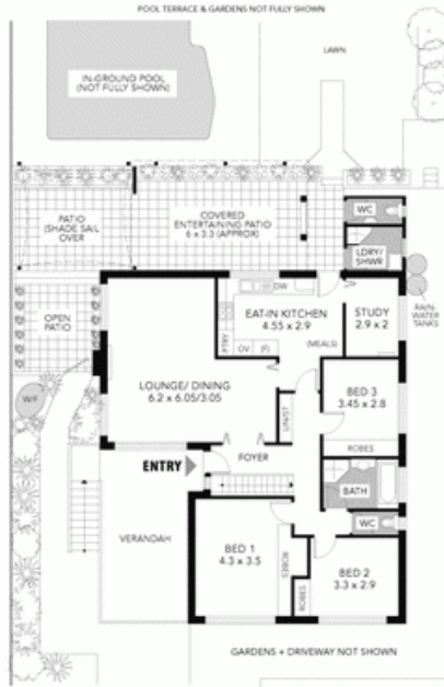
MAIN PLAN: GROUND FLOOR