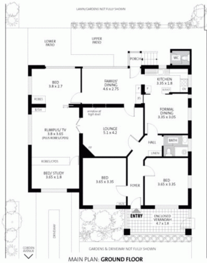
MAIN PLAN: GROUND FLOOR