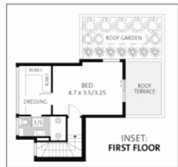
INSET: FIRST FLOOR

FLOOR PLANS - DAVID DIXON (02) 9411 7237