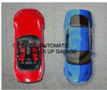
(NOT ACTUAL LOCATION)