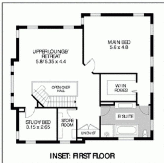
INSET: FIRST FLOOR