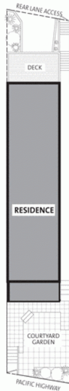
SITE PLAN (NOT TO SCALE, APPROXIMATE LAYOUT ONLY)

APPROXIMATE SCALE GUIDE (METRES) 0 1 2 3