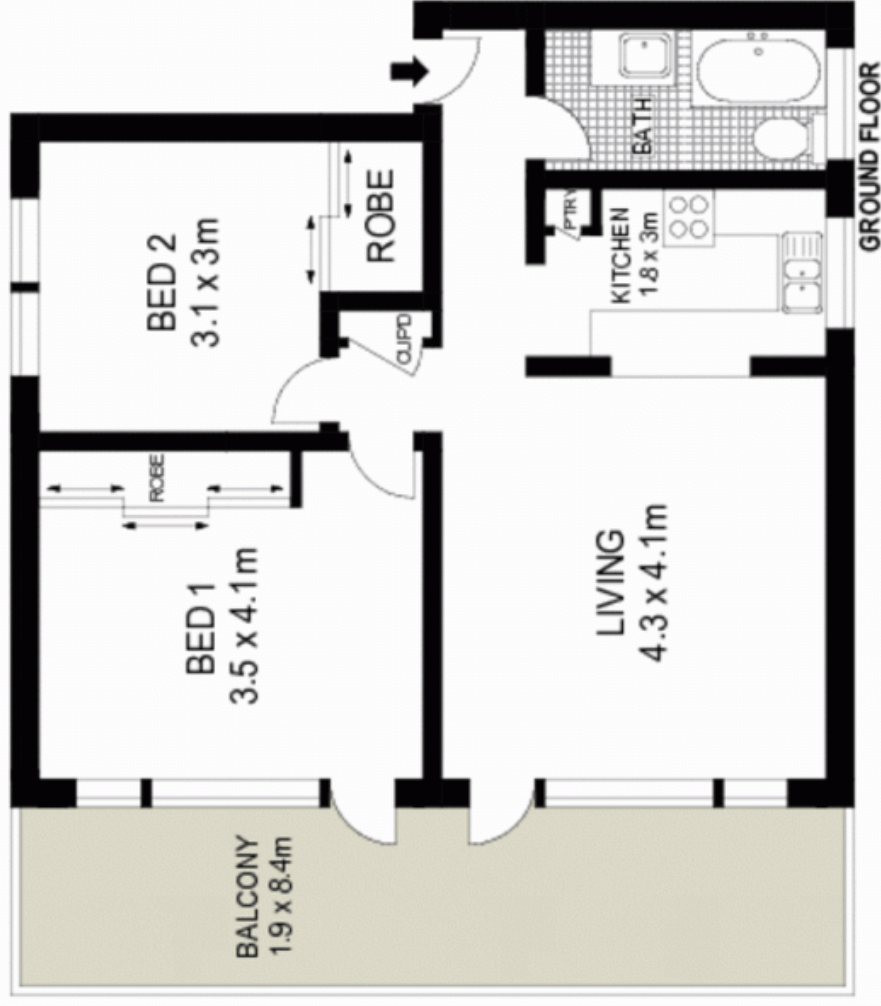
ELEVATED GROUND FLOOR