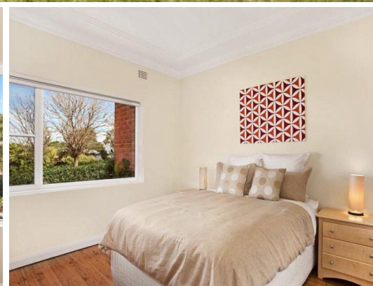
14 Ellery Parade SEAFORTH, NSW 3 1 2