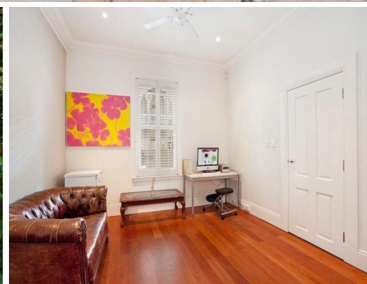
76 Pittwater Road MANLY, NSW 3 1