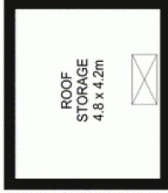
ATTIC (ACCESS VIA LADDER)