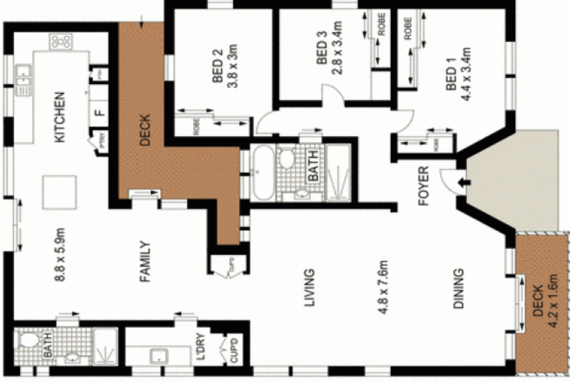
ELEVATED GROUND FLOOR