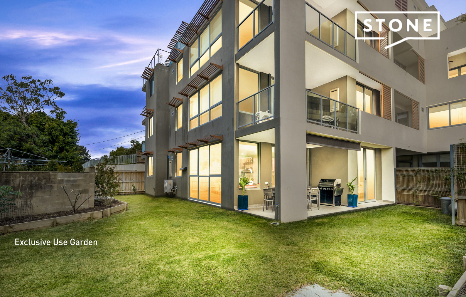
Exclusive Use Garden