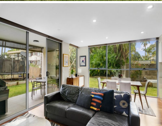
Exclusive Use Garden