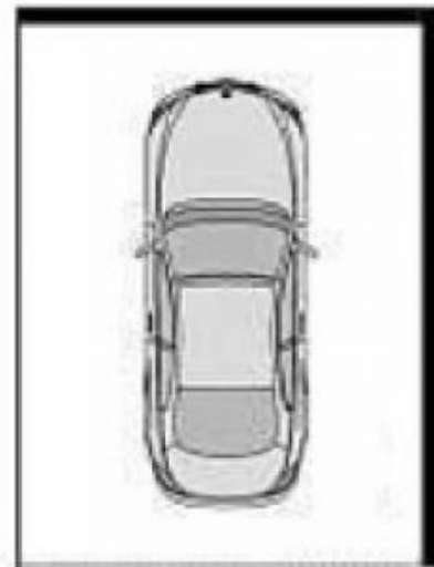
one security car space