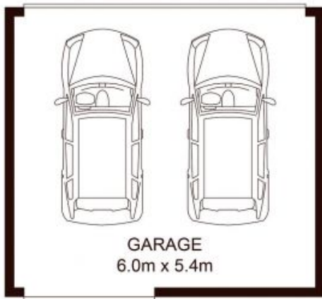
GARAGE 6.0m x 5.4m