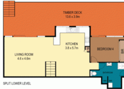
SPLIT LOWER LEVEL