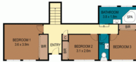
SPLIT UPPER LEVEL