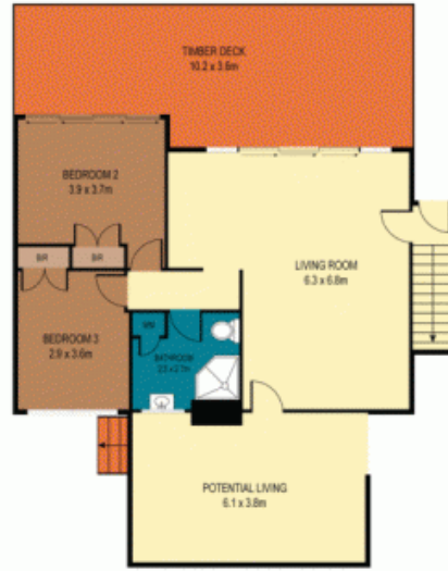
MID GROUND LEVEL