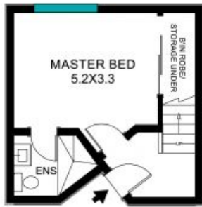
LEVEL 1 - ENTRY