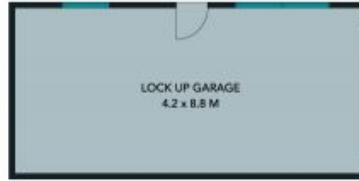
UNDER MASTER BEDROOM