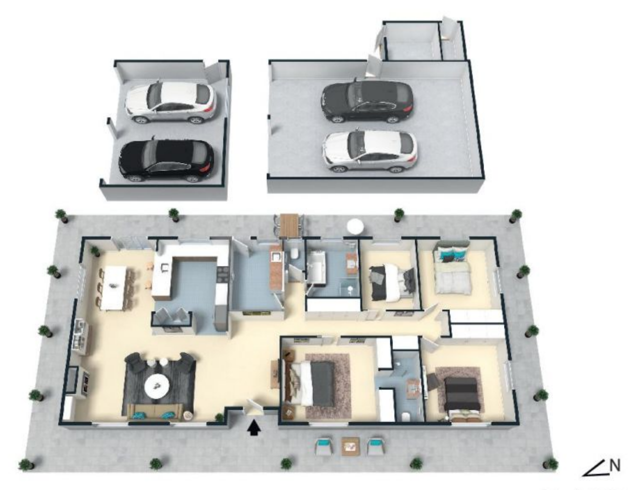
Produced by DIAKRIT