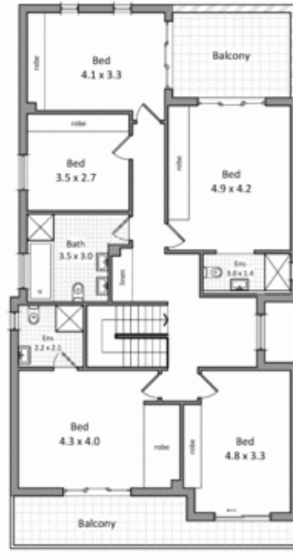
First level floor plan