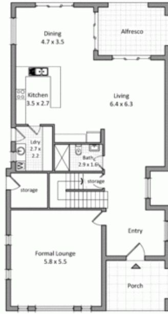
Ground level floor plan