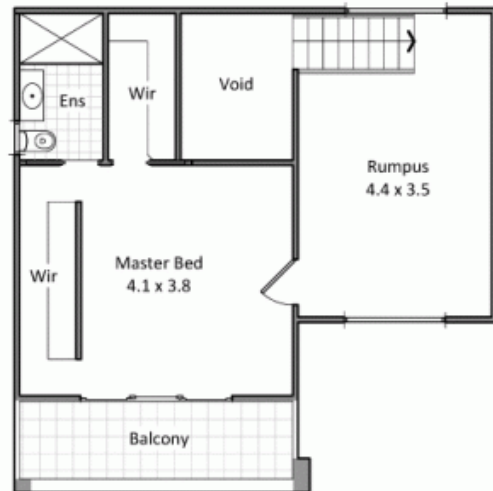
First level floor plan