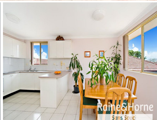
Raine&Horne Sans Souci