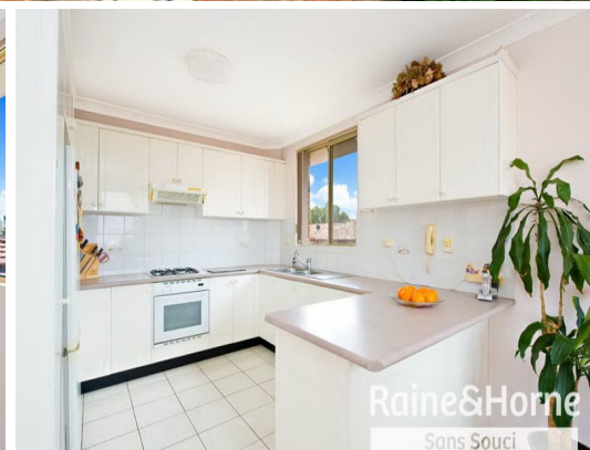
Raine&Horne Sans Souci