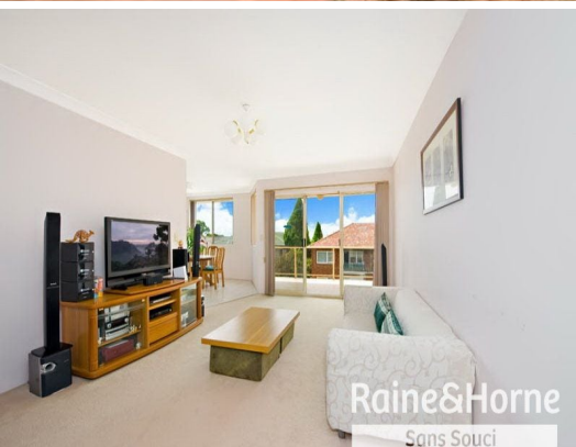
Raine&Horne Sans Souci