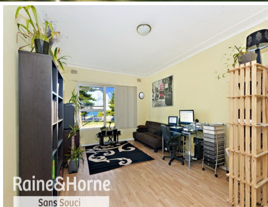
Raine & Horne Sans Souci