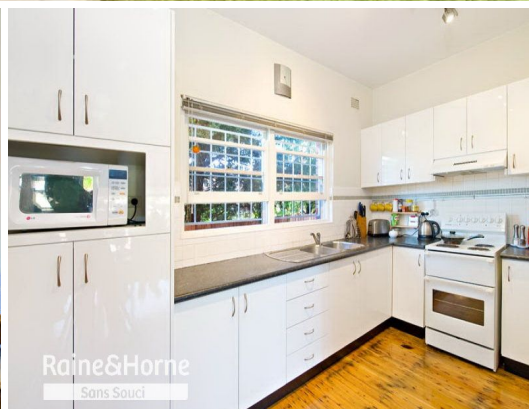
Raine&Horne Sans Souci