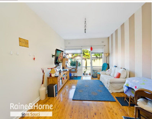
Raine&Horne Sans Souci