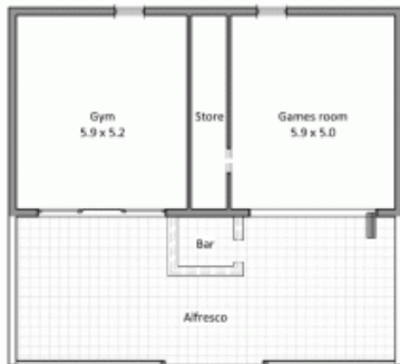
Gym & Games room floor plan