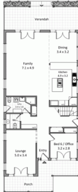
Ground level floor plan