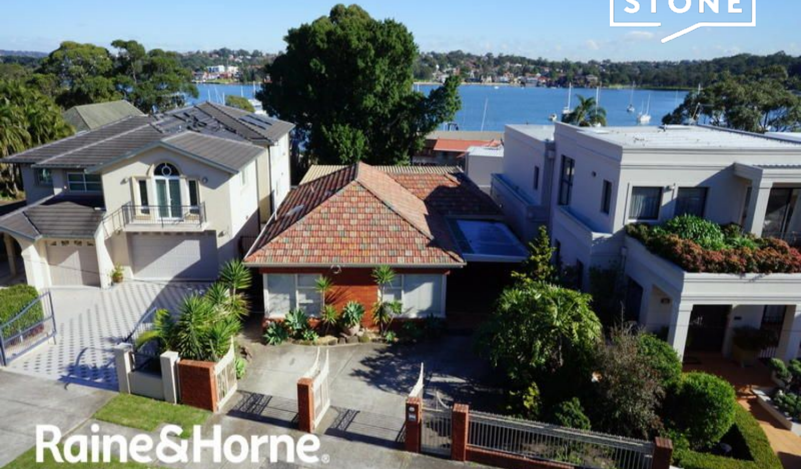
Potential View from 2nd Storey addition