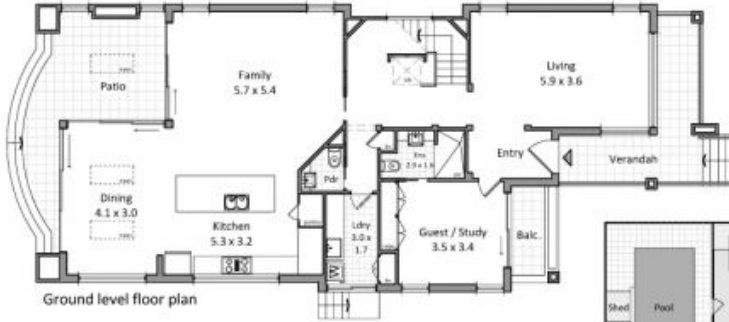
Ground level floor plan