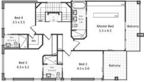
First level floor plan