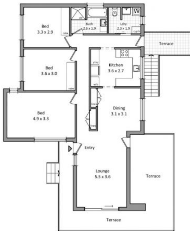
Upper ground level floor plan