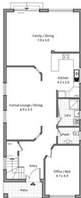
Ground level floor plan