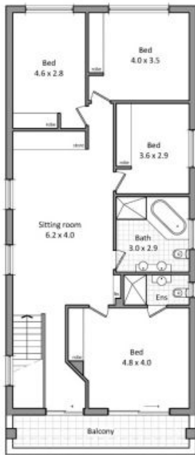
First level floor plan