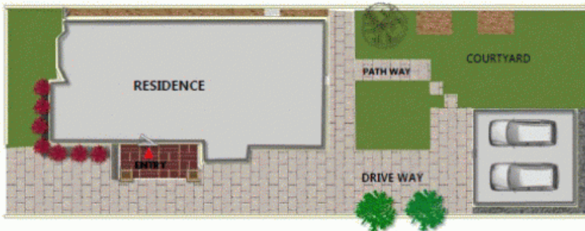
SITE PLAN ( Not to Scale)