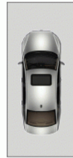
SECURE CAR SPACE

DISCLAIMER: THIS IS FOR ILLUSTRATIVE PURPOSES ONLY. ALL DIMENSIONS ARE APPROXIMATE AND NOT CONSTITUTE PART OF ANY LEGAL DOCUMENTS. FURNITURE NOT INCLUDED. All dimensions are approximate Actual dimension may vary. Real Estate Floor Plans Prepared by: b4bulb75@gmail.com