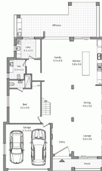
Ground level floor plan