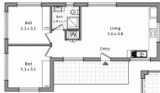
Granny flat floor plan