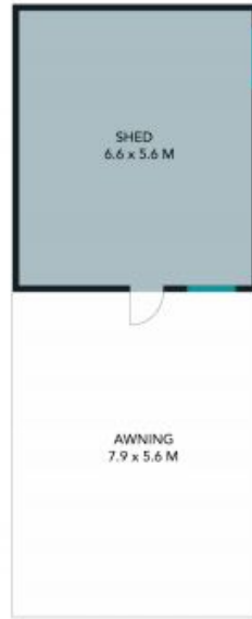
[NOT IN POSITION]