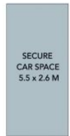
(NOT IN POSITION)