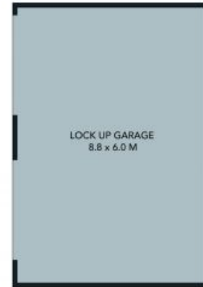
LOCK UP GARAGE 8.8 x 6.0 M