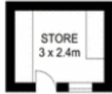
ELEVATED GROUND FLOOR