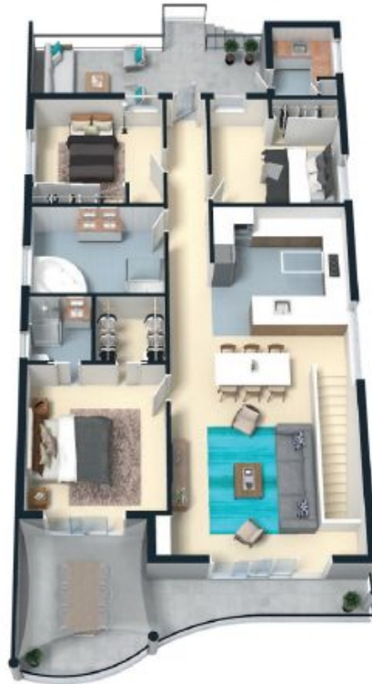
FIRST FLOOR (NO 83A)