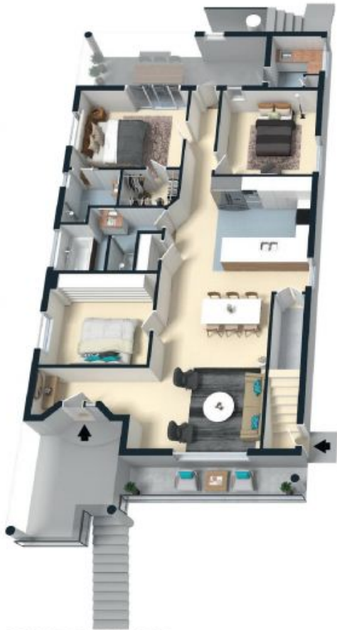
GROUND FLOOR (NO 83)