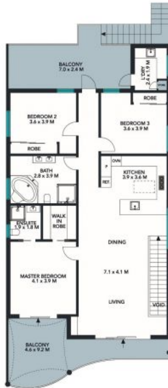
FIRST FLOOR (NO 83A)