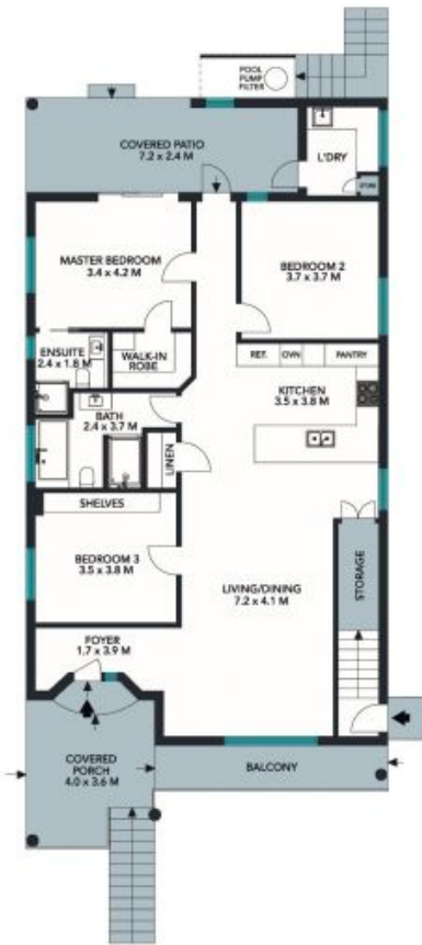
GROUND FLOOR (NO 83)