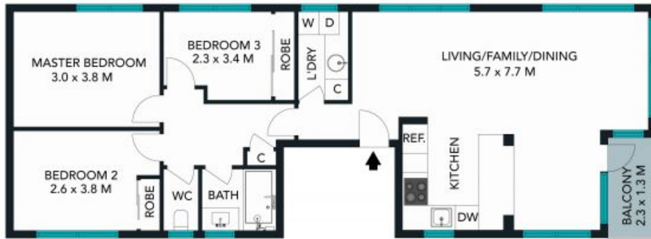
ELEVATED GROUND FLOOR

The floor plan is not to scale; measurements are indicative and in metres. Exterior elements are not in position. Plans should not be relied on. Interested parties should make and rely on their own enquiries.