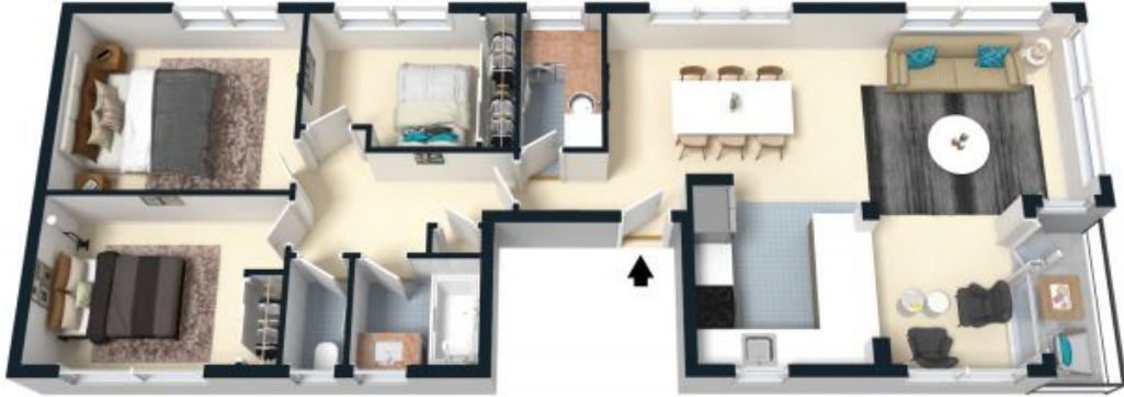
ELEVATED GROUND FLOOR