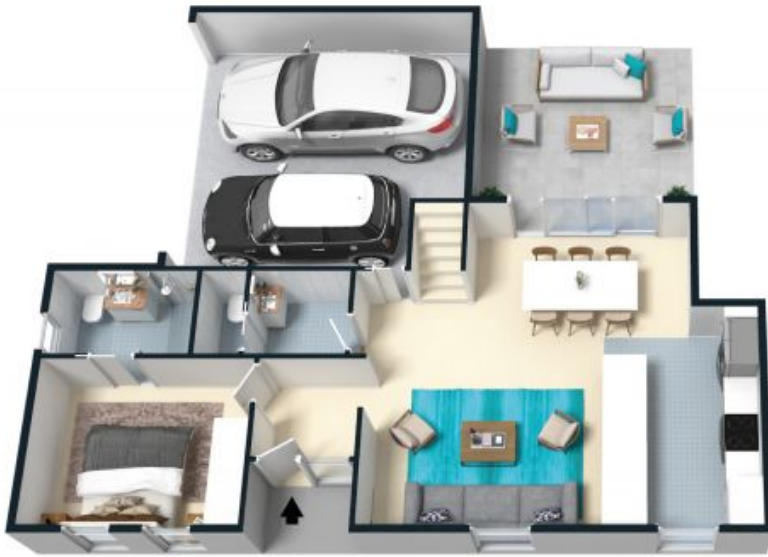
UNIT 1 GROUND FLOOR