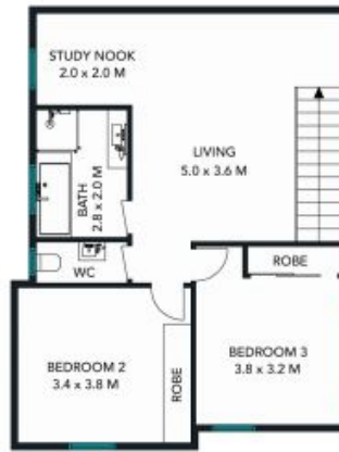
UNIT 1 FIRST FLOOR