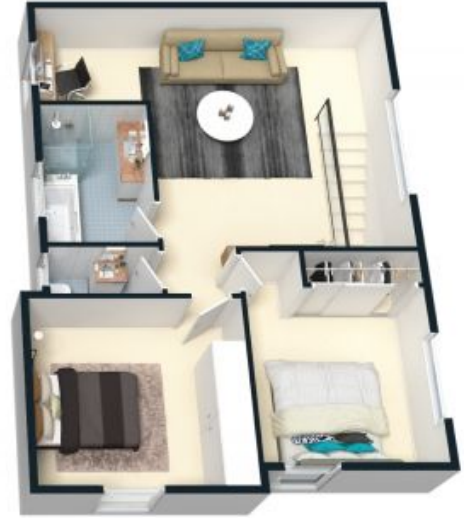
UNIT 1 FIRST FLOOR