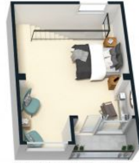
GRANNY FLAT FIRST FLOOR