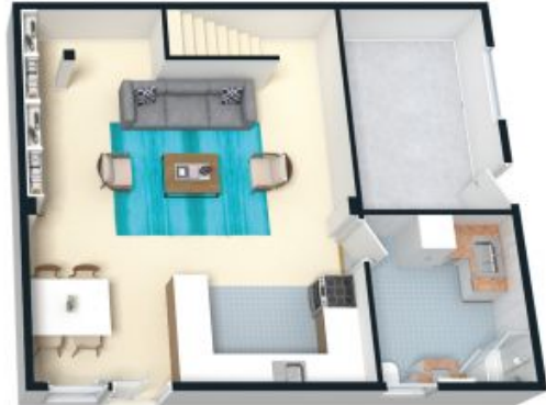
GRANNY FLAT GROUND FLOOR

The floor plan is not to scale, measurements are indicative and in metres. All features included in this 3D plan are for inspiration purposes only. This is not an exact replica of the property or the position of exterior elements. Plans should not be relied on. Interested parties should make and rely on their own enquiries.