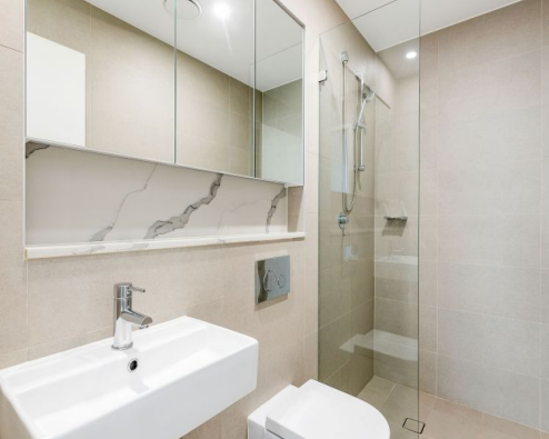
117 Bluewater Street Meadowbank, NSW